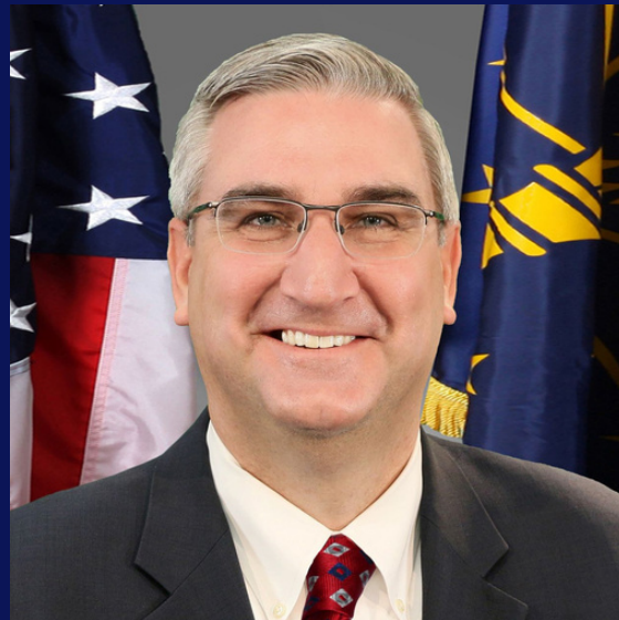
Keynote Speaker Eric Holcomb Governor of Indiana