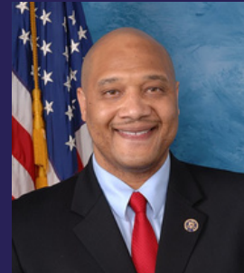
ANDRÉ D. CARSON