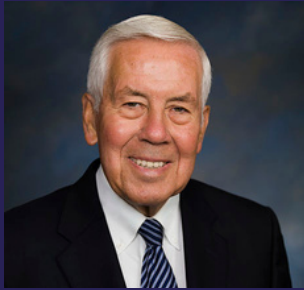
RICHARD LUGAR (dec.)